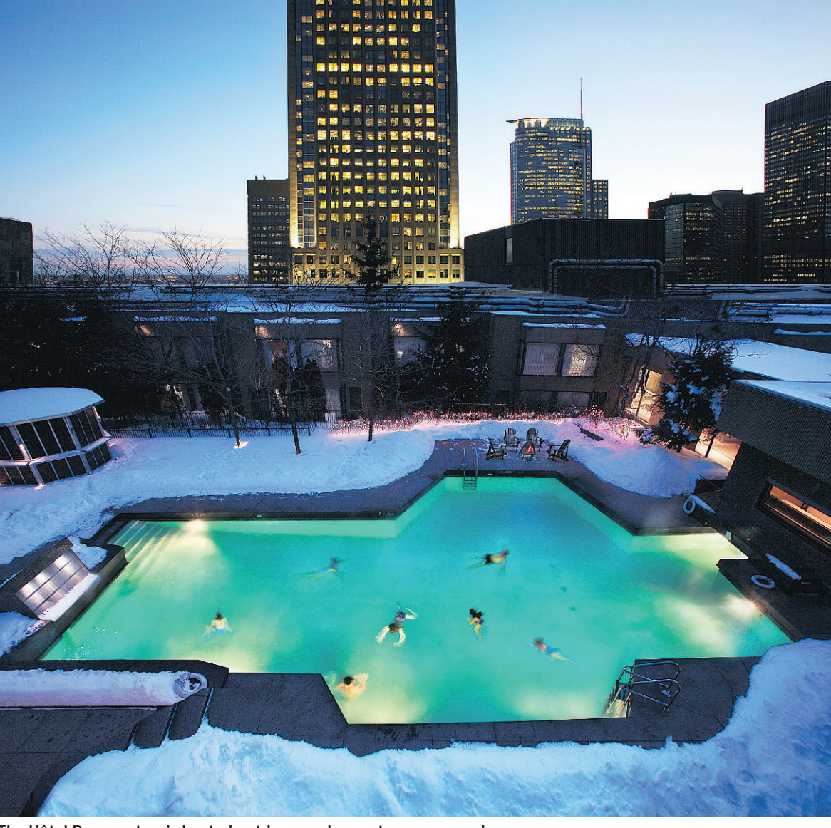
The Hôtel Bonaventure's heated outdoor pool operates year-round.

With the hotel connected to the vast exhibition halls of Place Bonaventure and within blocks of every major office tower, the Bonaventure hops with business guests and conventioneers.