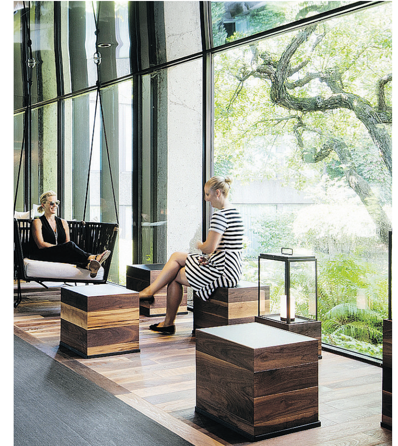
The property redesigned its lobby and restaurants.

Price: Rooms cost $169-$250 (suites cost more) including outdoor heated pool/hot tub; fitness, in-room coffee, guest computers, Wi-Fi, concierge, baby gear. Discount for CAA and also for patrons of Bell Centre and Place Bonaventure. Parking is included